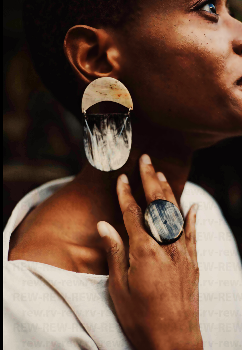
Handmade horn Earrings