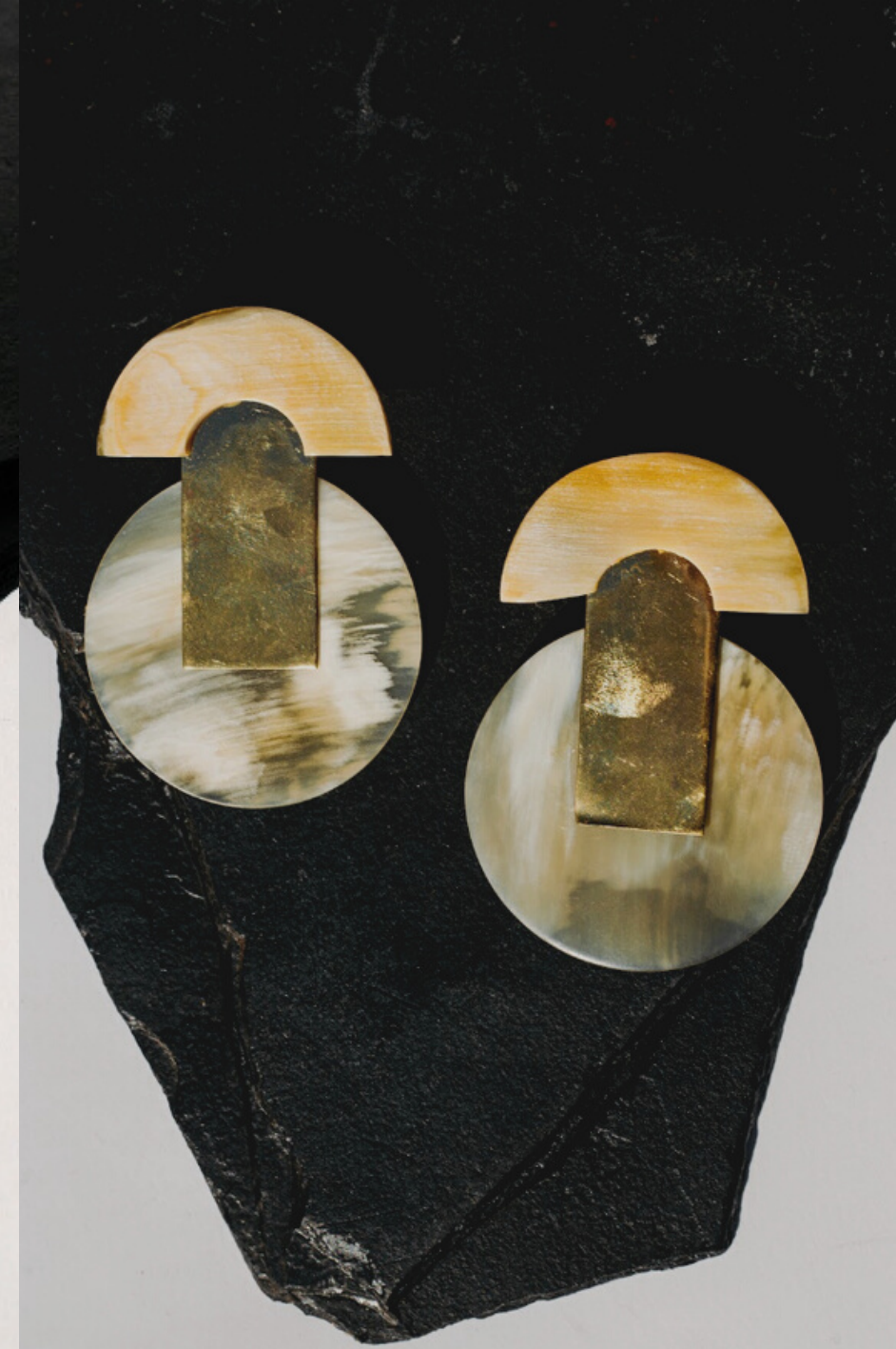
Handmade brass and Horn Earrings