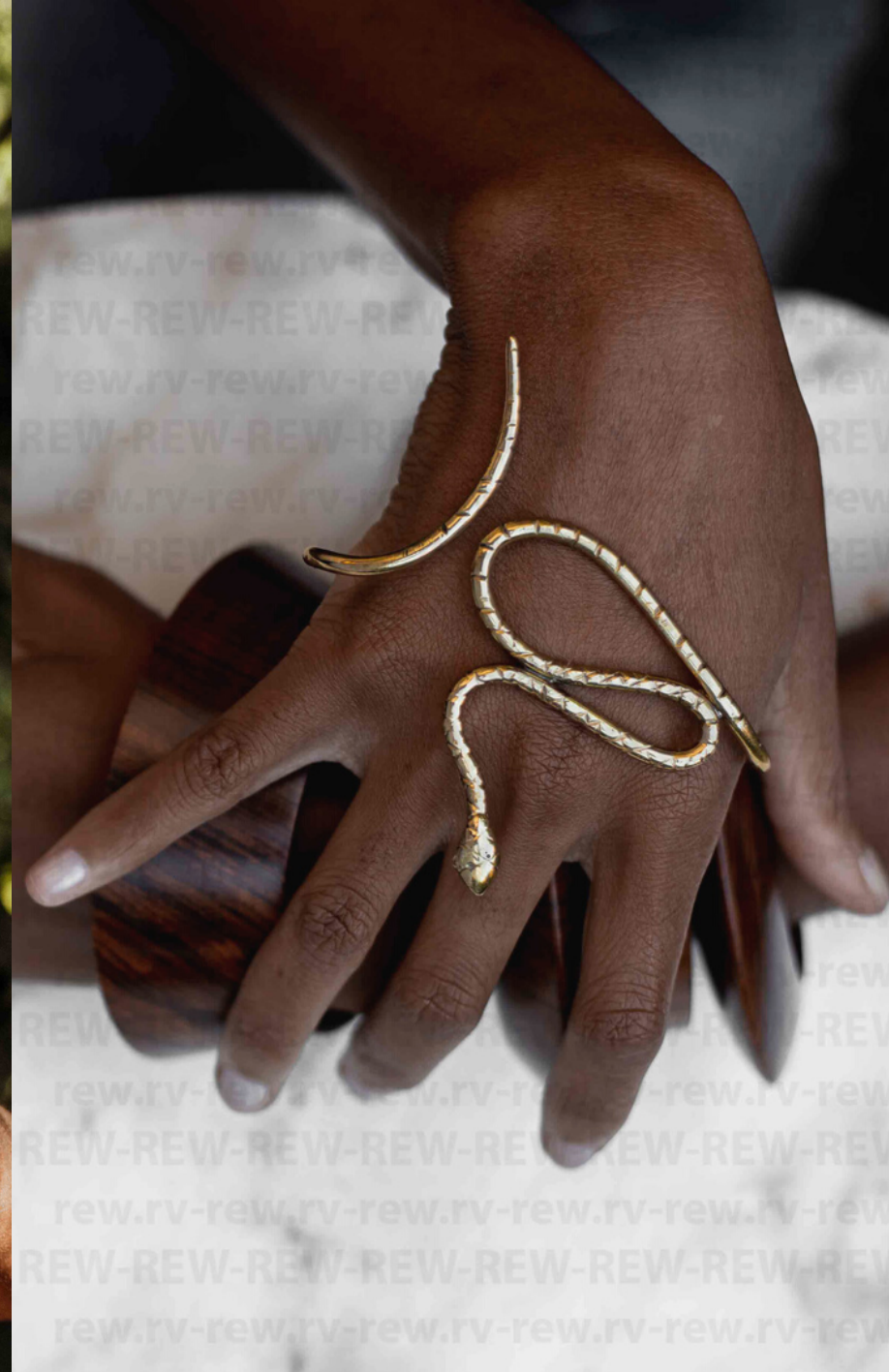
Handmade "SNAKE" brass palm bracelet