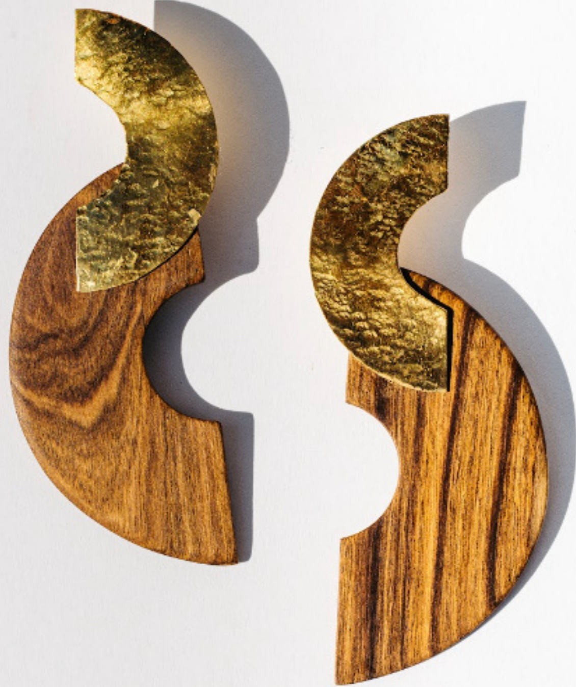
Handmade brass and wood