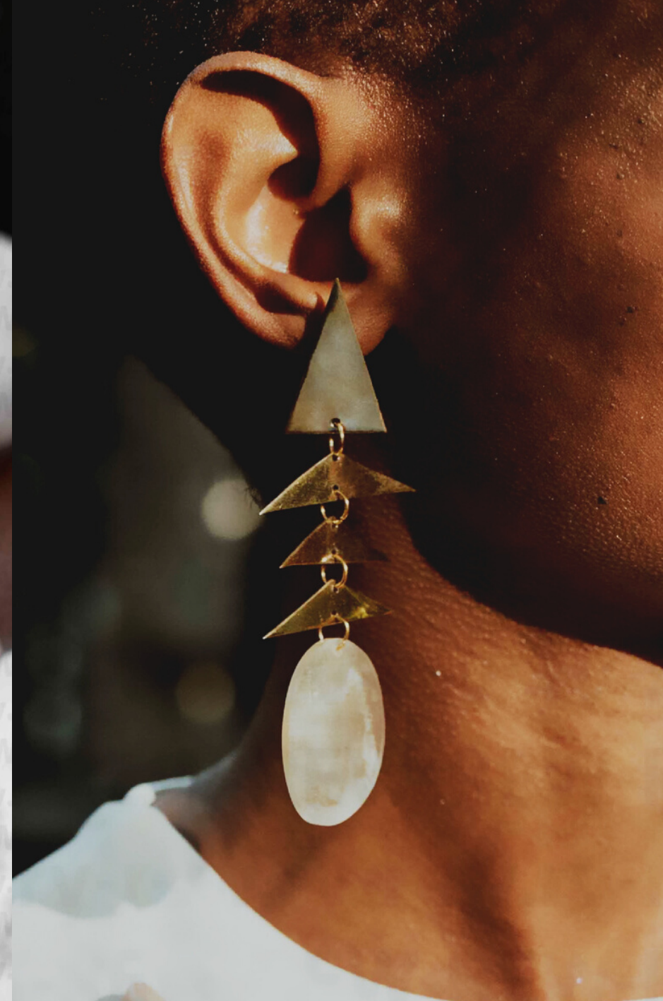
Brass and Horn earrings