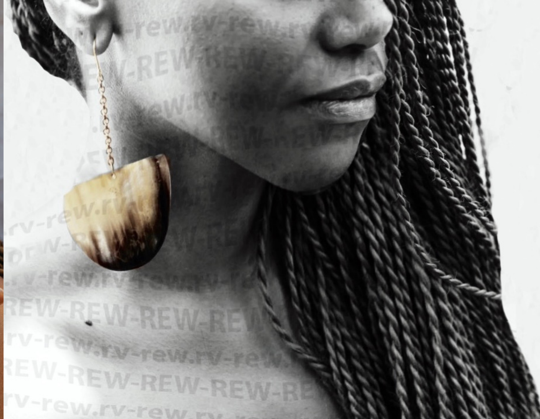
Handmade horn and brass earrings