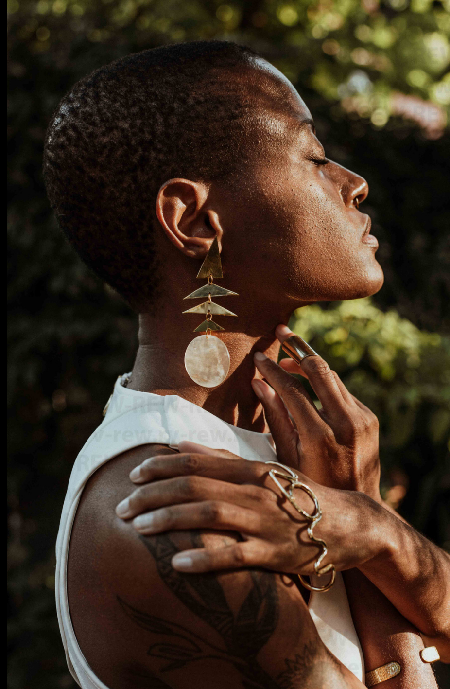
Handmade brass palm "MOZ" bracelet