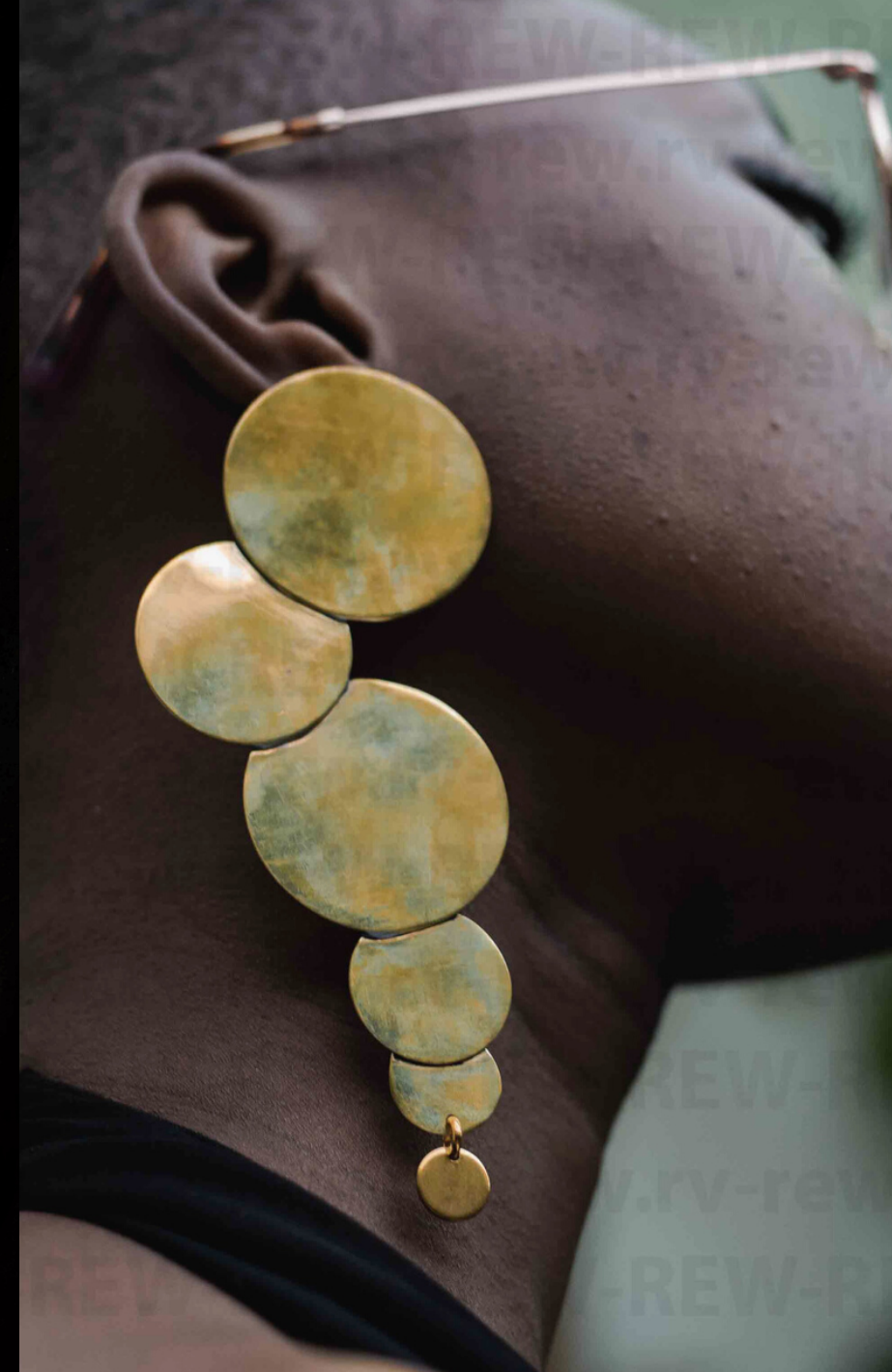
Handmade brass earrings