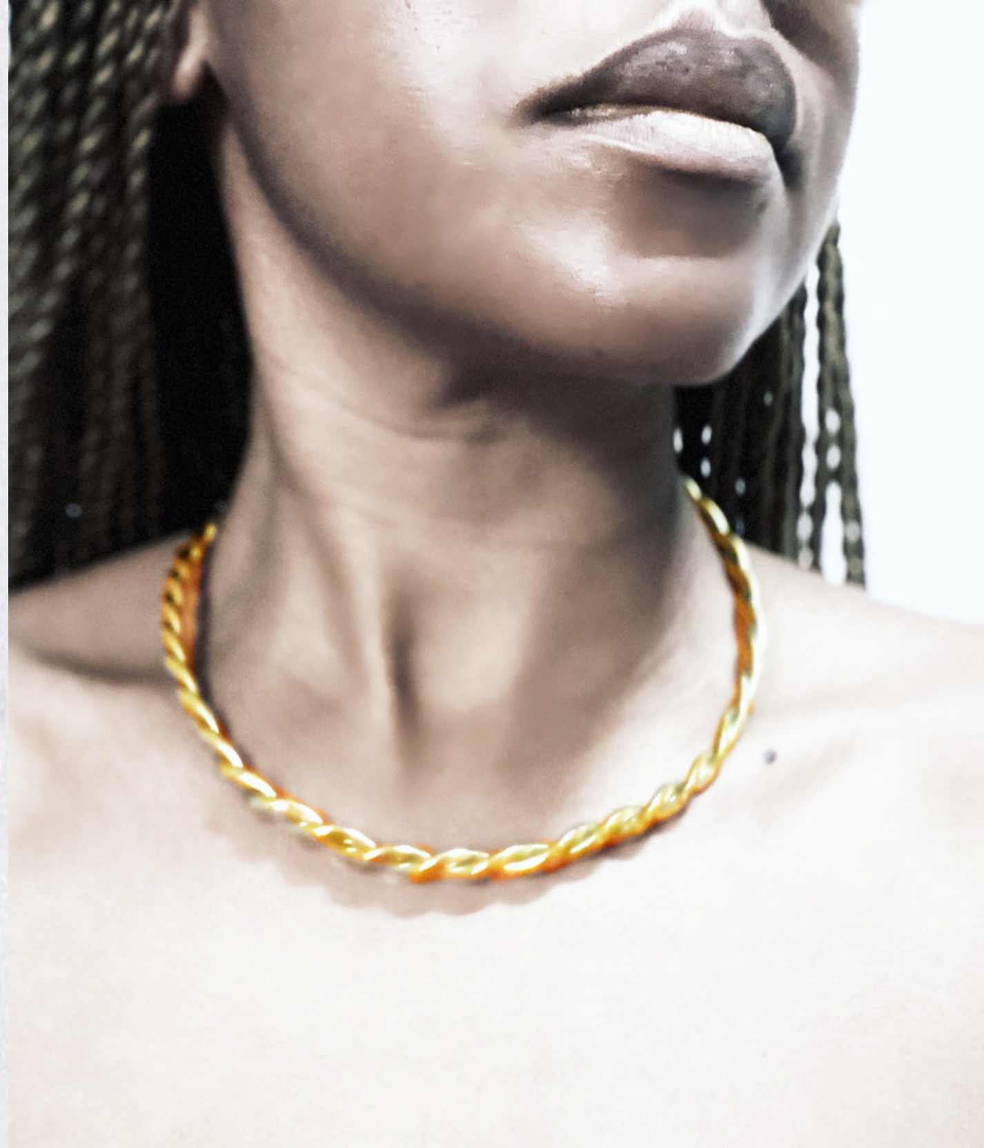
Handmade brass Necklace