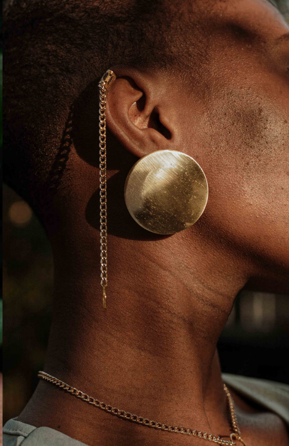
Handmade brass earrings