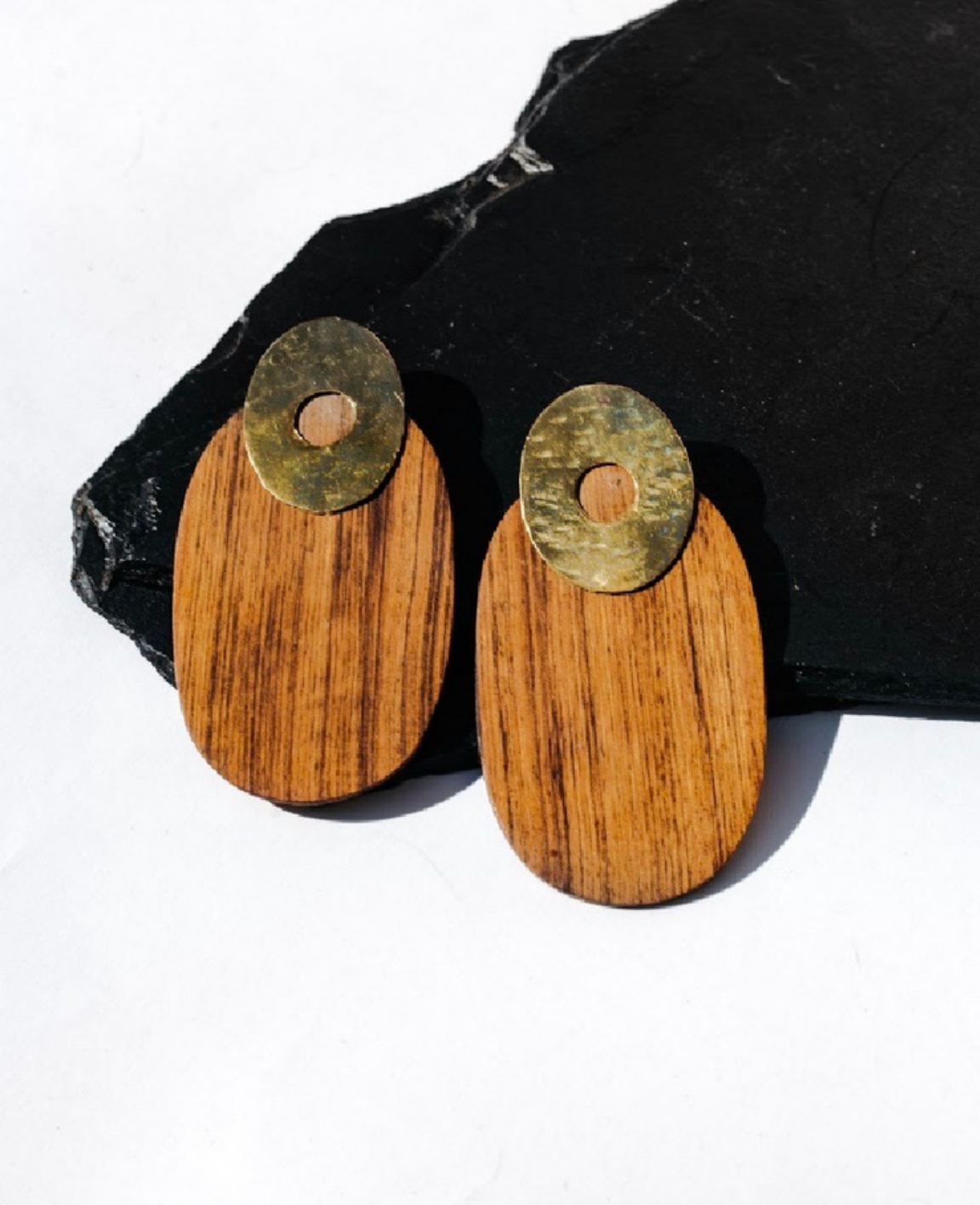
Handmade Wood and brass earrings