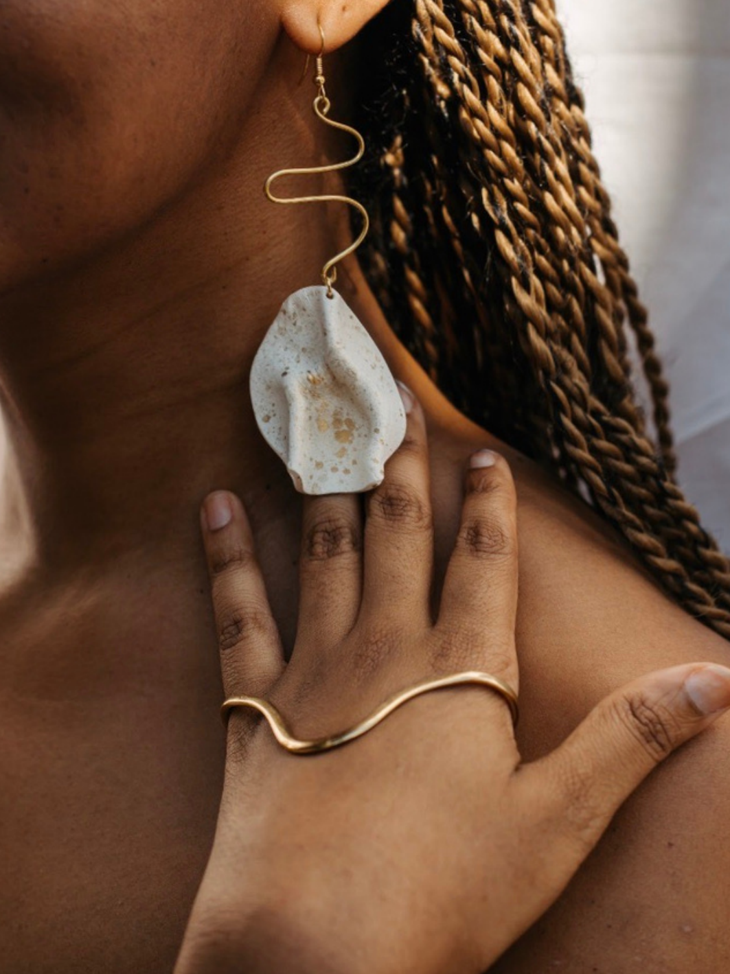
Handmade brass palm bracelet