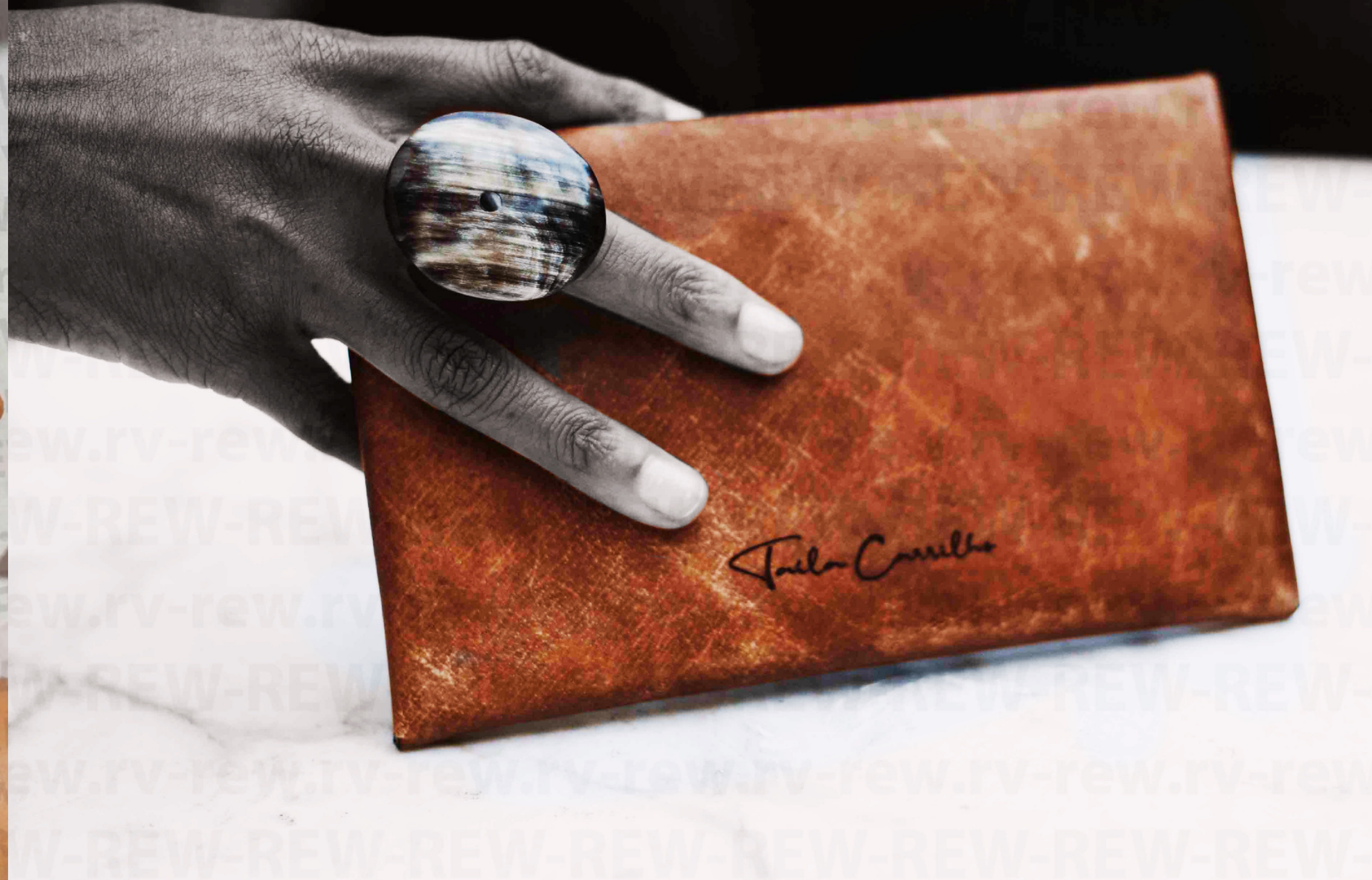
Handmade Leather envelope wallet