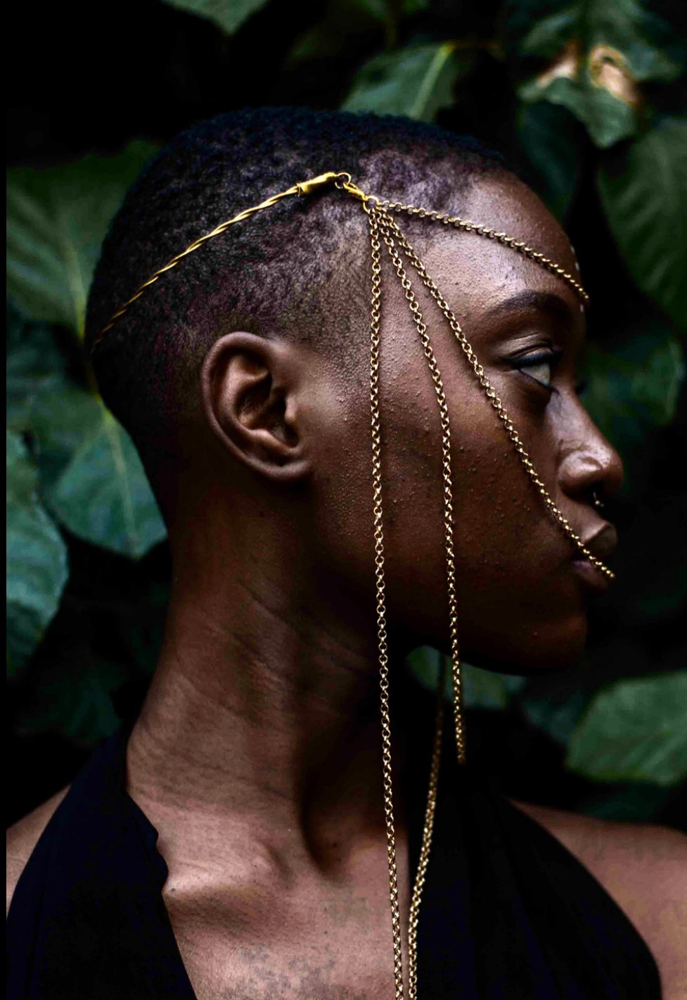
Handmade brass crown