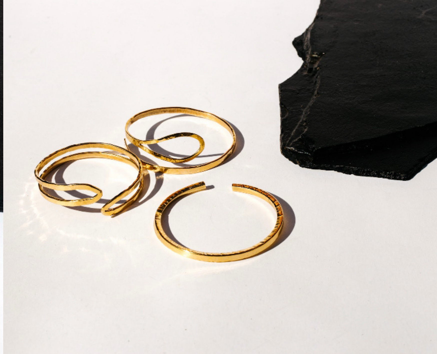
Handmade Brass bracelets