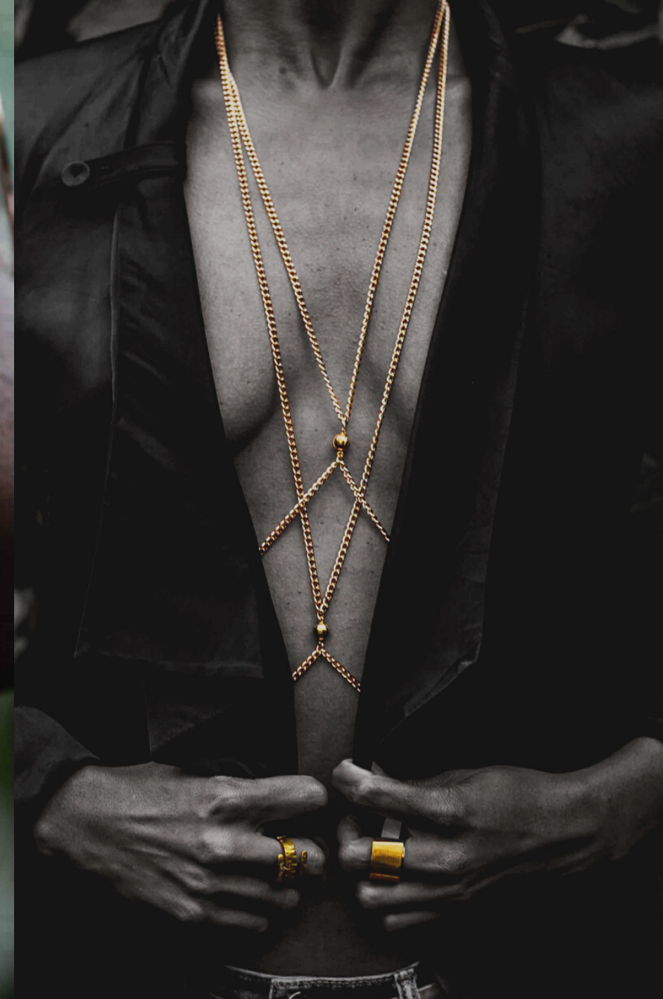
Handmade brass body chain