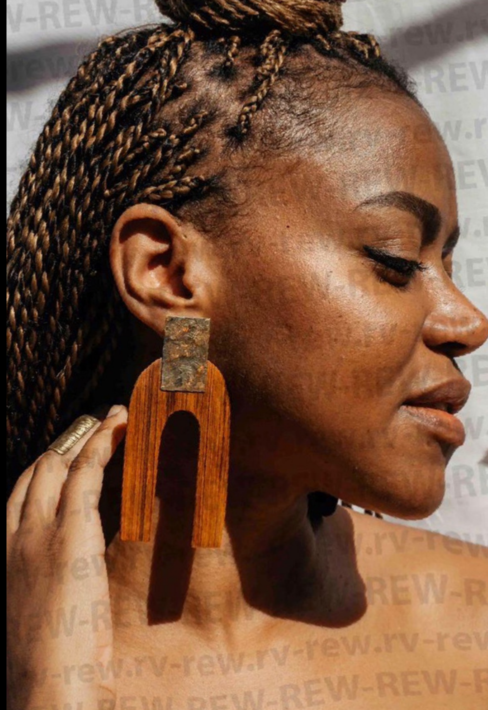
Handmade Wood and brass earrings