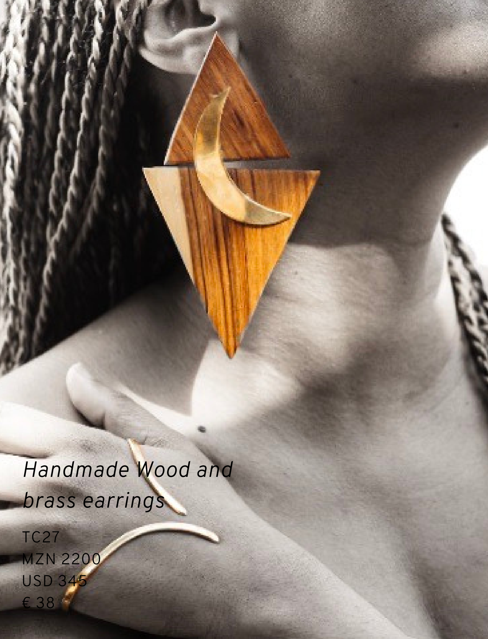
Handmade Wood and brass earrings