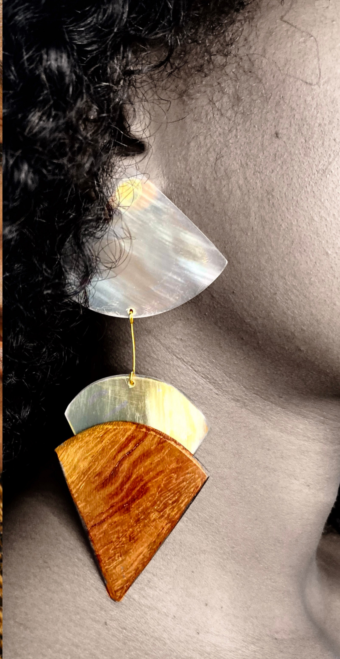
Handmade Horn and wood earrings