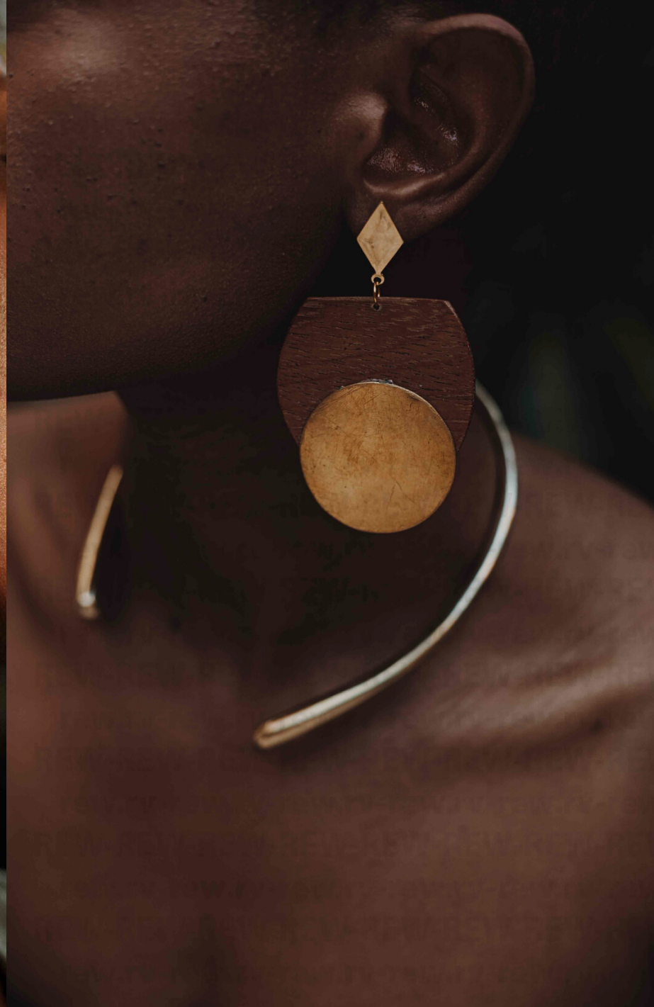
Handmade Wood and brass earrings