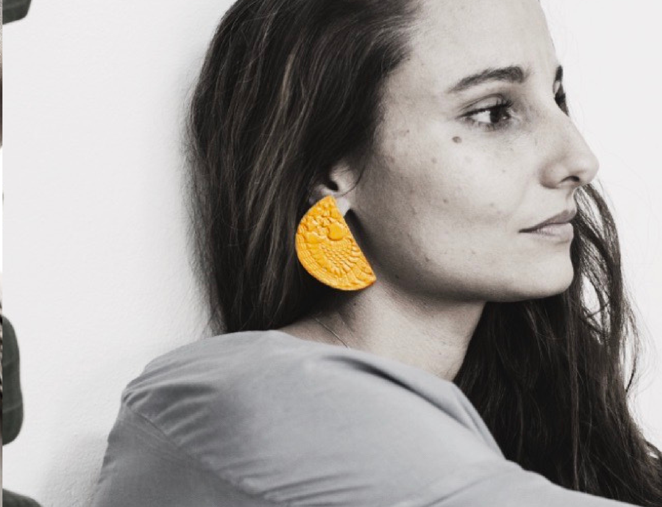
Handmade Ceramic earrings