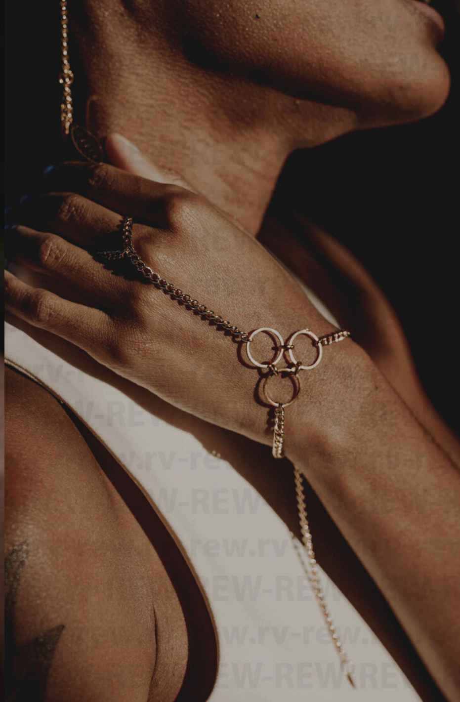
Handmade brass palm chain