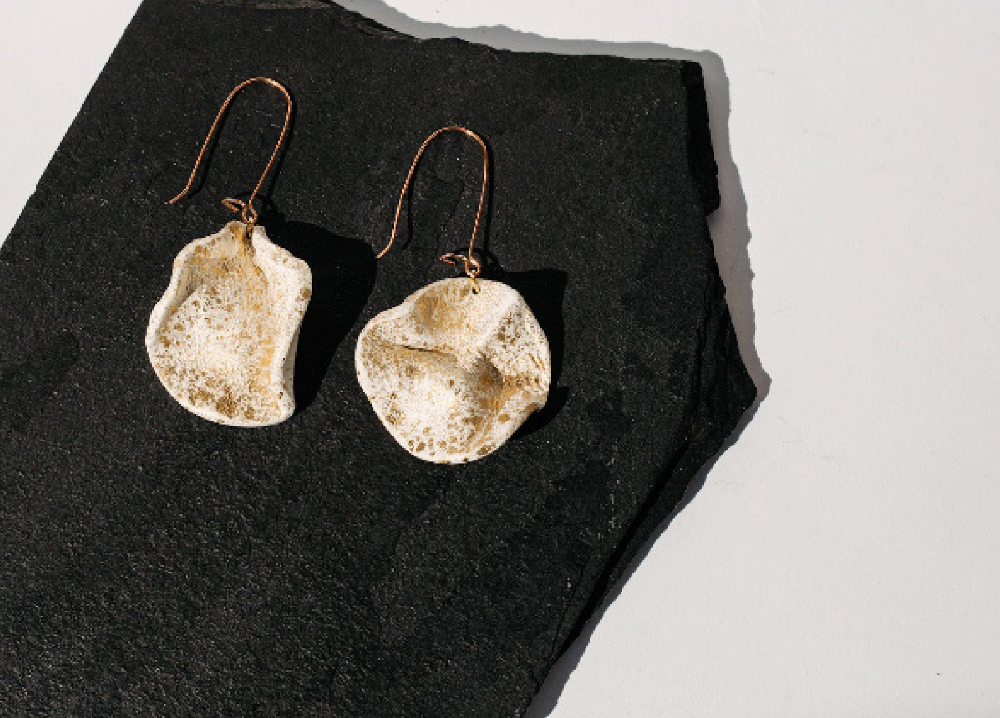
Handmade Ceramic earrings