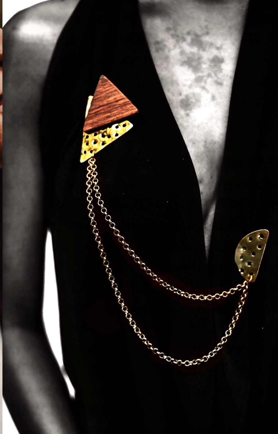
Handmade brass brouch chain