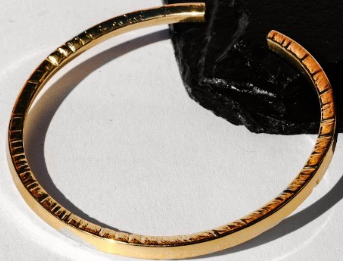
Handmade brass bracelet