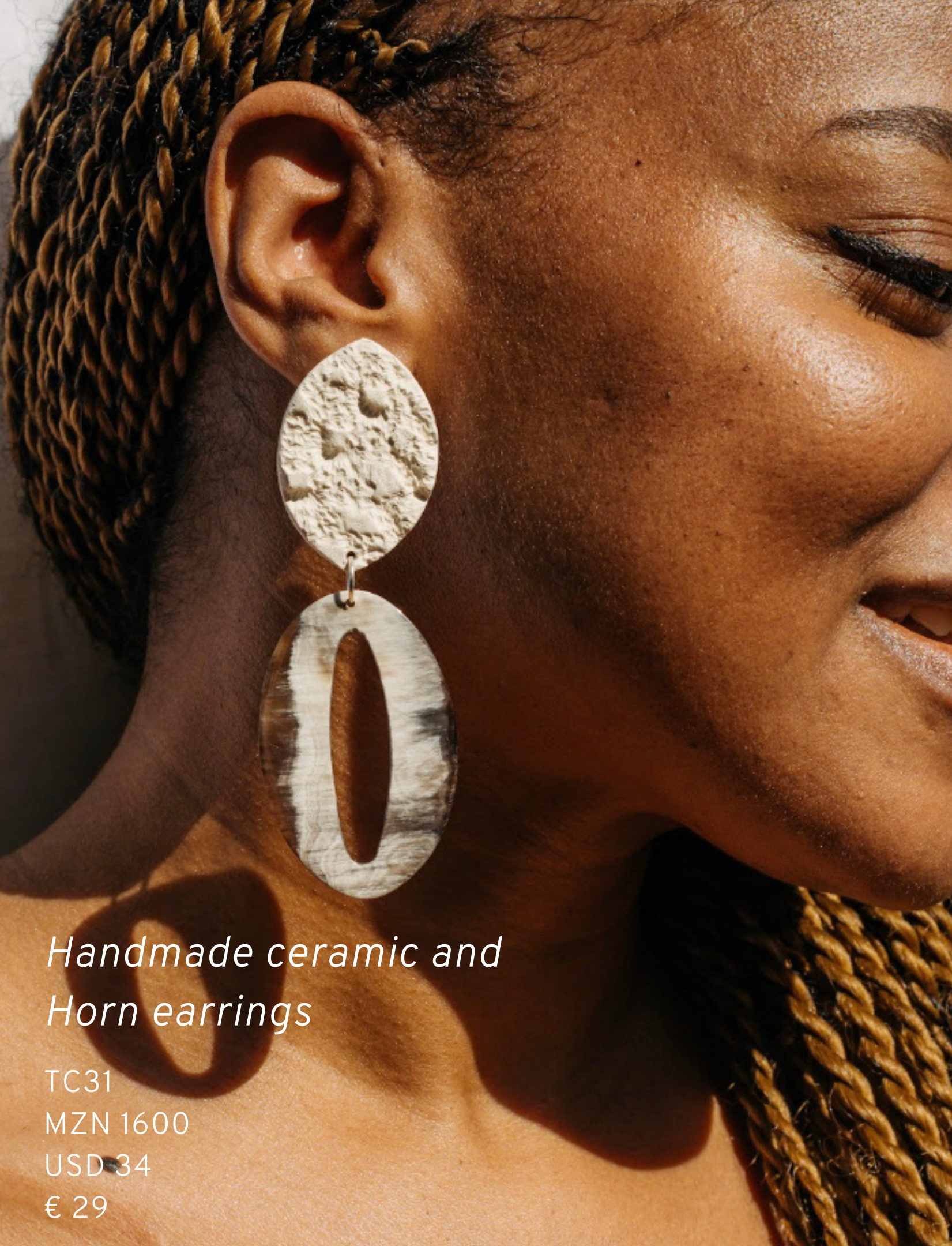
Handmade ceramic and Horn earrings