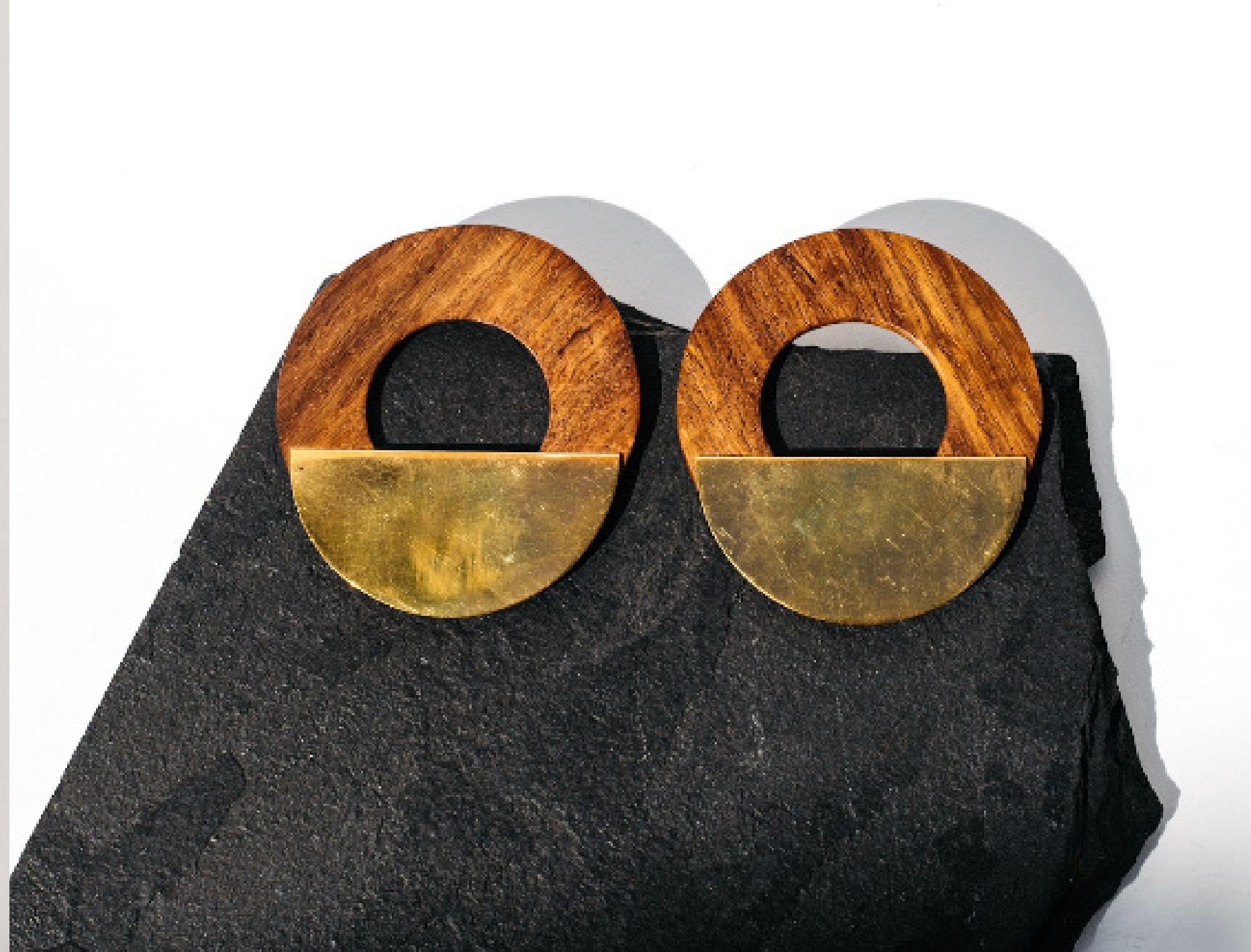
Handmade brass and wood Earrings